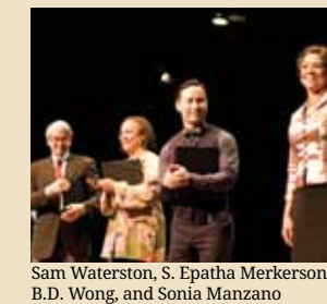
Sam Waterston, S. Epatha Merkerson, B.D. Wong, and Sonia Manzano